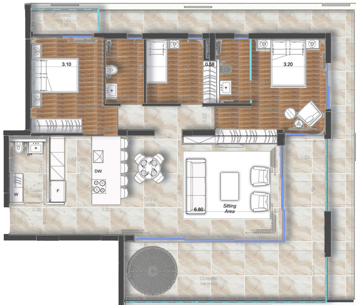
APT. 602 ROOF GARDEN FLOOR PLAN