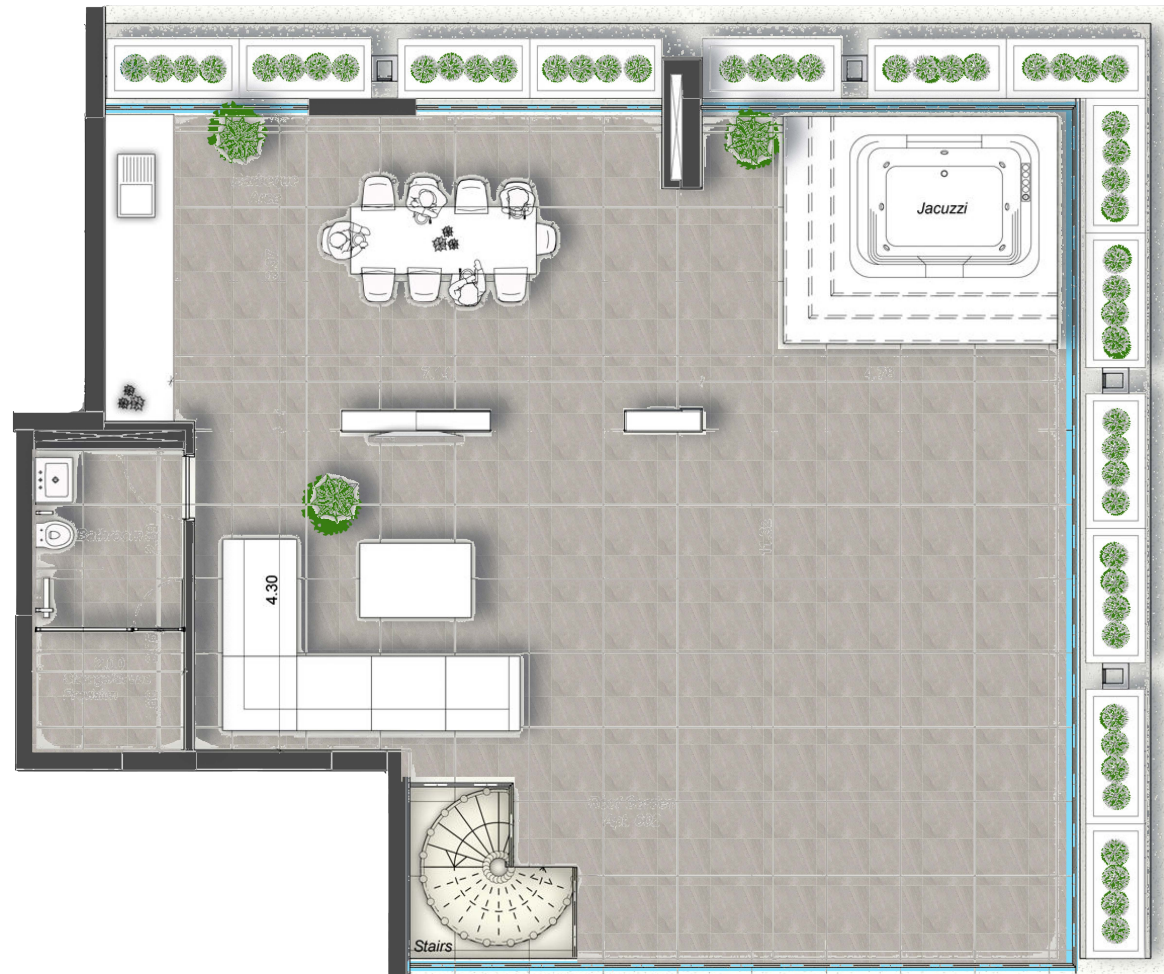
APT. 602 FLOOR PLAN