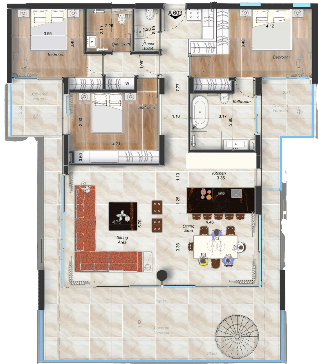
APT. 603 FLOOR PLAN