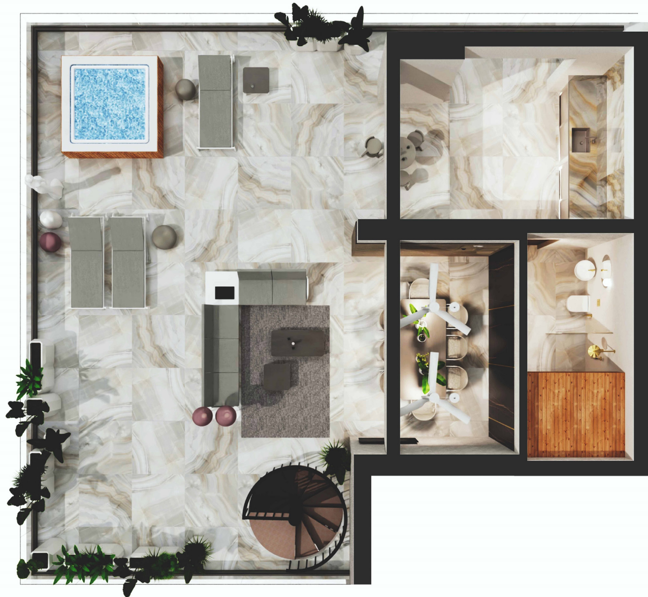
APT. 601 ROOF GARDEN FLOOR PLAN