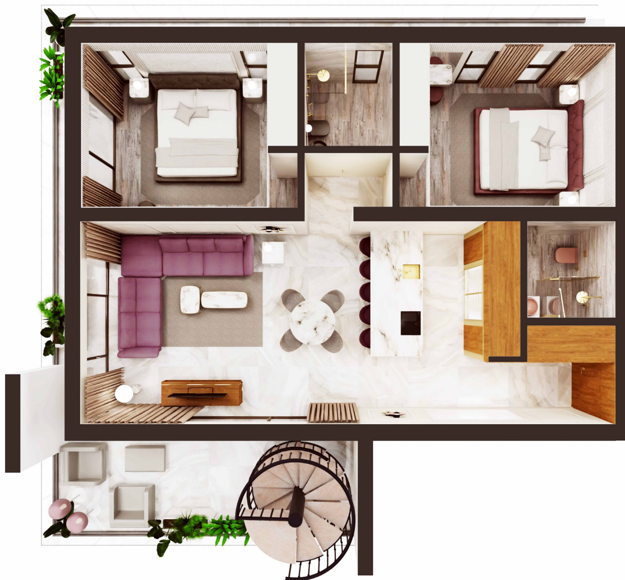
APT. 601 FLOOR PLAN